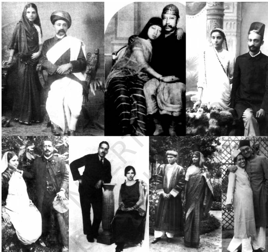
Couples from different regions 1880s to 1930s: Clockwise from top left corner: Gujarat; Tripura; Bombay; Aligarh; Hyderabad; Goa; Calcutta. From Malavika Karlekar, Visualising Indian Women 1875–1947, Oxford University Press, New Delhi.

Note: In this chapter, the word “State” has a capital S when it is used to denote the federal units within the Indian nation-state; the lower case ‘state’ is used for the broader conceptual category.