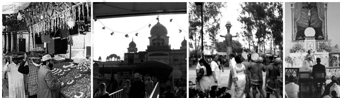
Different religious worship places

In everyday language, the word ' communalism ' refers to aggressive chauvinism based on religious identity. Chauvinism itself is an attitude that sees one's own group as the only legitimate or worthy group, with other groups being seen – by definition – as inferior, illegitimate and opposed. Thus, to simplify further, communalism is an aggressive political ideology linked to religion. This is a peculiarly Indian, or perhaps South Asian, meaning that is different from the sense of the ordinary English word. In the English language, "communal" means something related to a community or collectivity as different from an individual. The English meaning is neutral, whereas the South Asian meaning is strongly charged. The charge may be seen as positive – if one is sympathetic to communalism – or negative, if one is opposed to it.