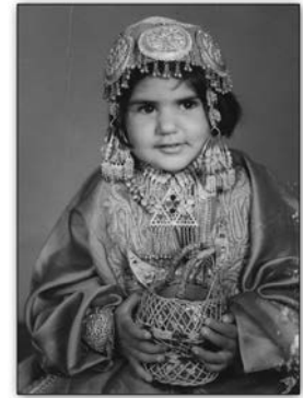
A Kashmiri girl

To be effective, the ideas of inclusive nationalism had to be built into the Constitution. For, as already discussed (in section 6.1), there is a very strong tendency for the dominant group to assume that their culture, language or religion is synonymous with the nation state. However, for a strong and democratic nation, special constitutional provisions are required to ensure the rights of all groups and those of minority groups in particular. A brief discussion on the definition of minorities will enable us to appreciate the importance of safeguarding minority rights for a strong, united and democratic nation.