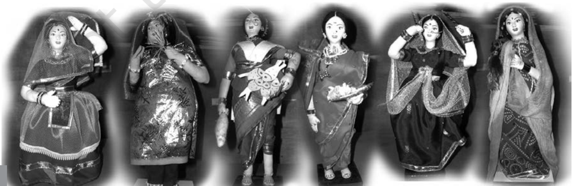
Left Margin: Food from different parts of India; Right top: Child dressed in Kashmiri Clothes; Bottom: Dolls dressed in costumes of different Indian States.

The notion of minority groups is widely used in sociology and is more than a merely numerical distinction – it usually involves some sense of relative disadvantage. Thus, privileged minorities such as extremely wealthy people are not usually referred to as minorities; if they are, the term is qualified in some way, as in the phrase ‘privileged minority’. When minority is used without qualification, it generally implies a relatively small but also disadvantaged group. The sociological sense of minority also implies that the members of the minority form a collectivity – that is, they have a strong sense of group solidarity, a feeling of togetherness and belonging. This is linked to disadvantage because the experience of being subjected to prejudice and discrimination usually heightens feelings of intra-group loyalty and interests (Giddens 2001:248). Thus, groups that may be minorities in a statistical sense, such as people who are left-handed or people born on 29 th February, are not minorities in the sociological sense because they do not form a collectivity.